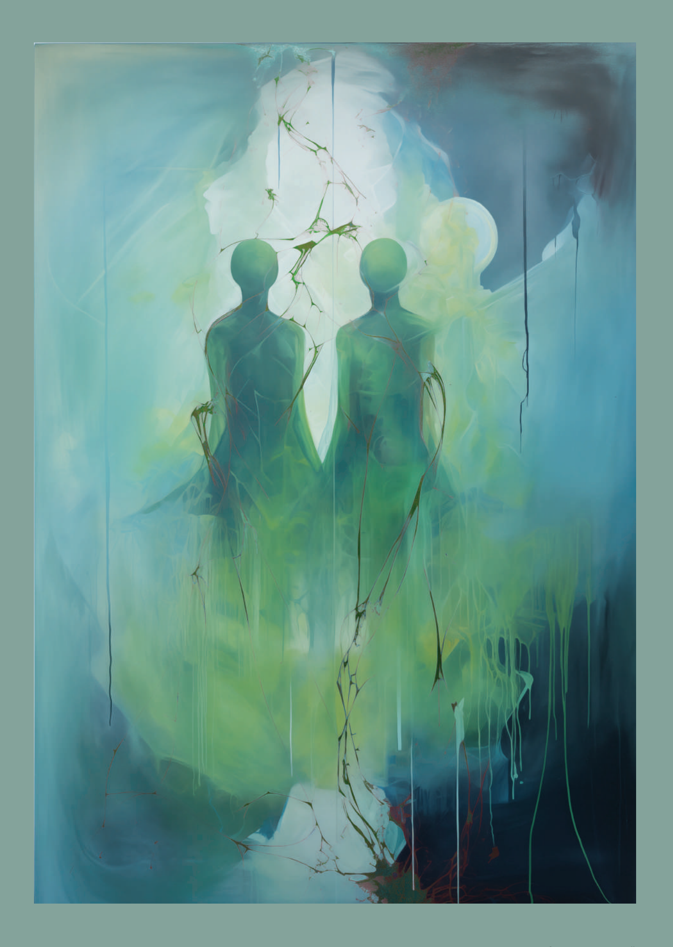
Derivative of "Kalte Farben"