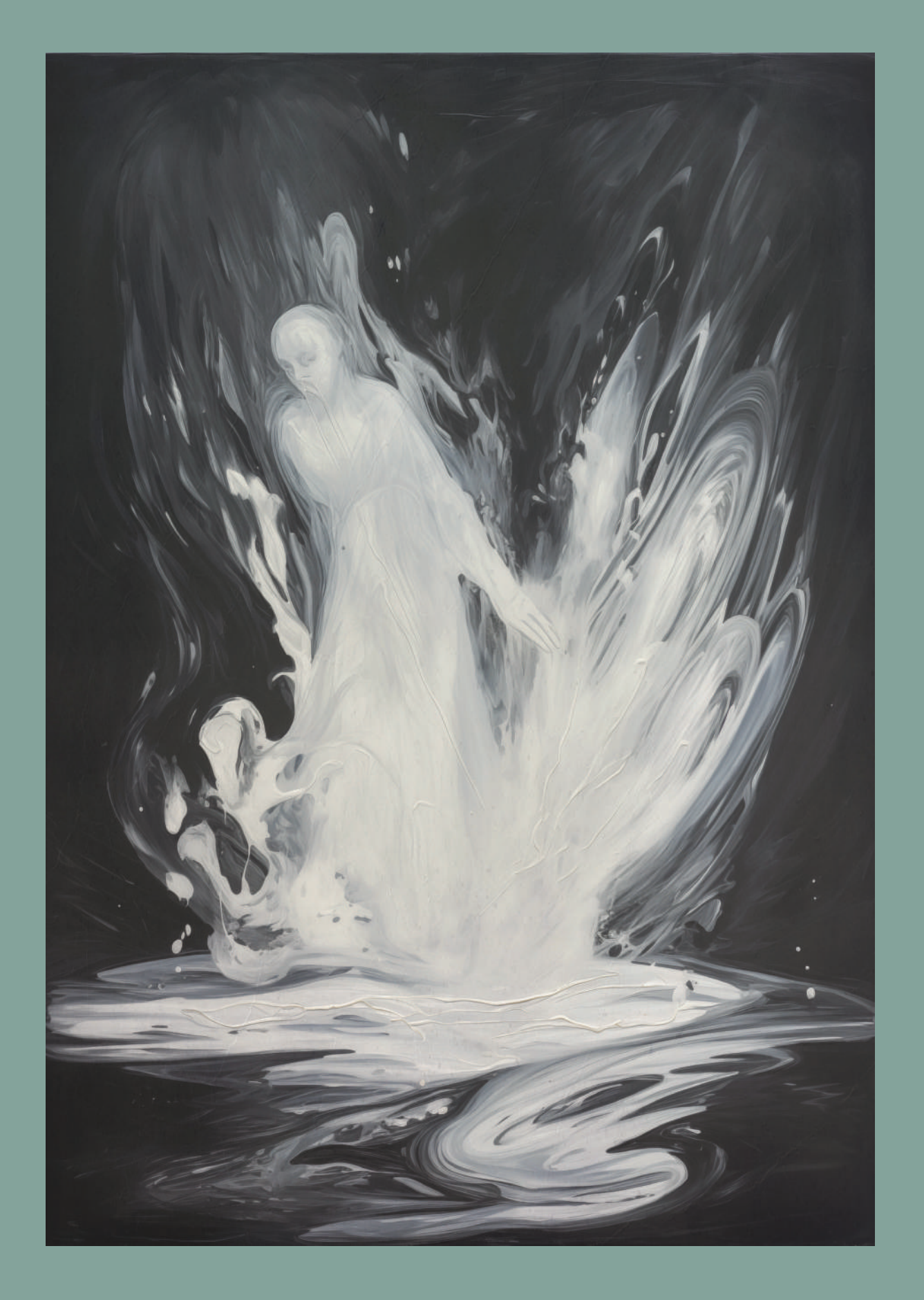
Derivative of "Licht und Finsternis"

Digital, AI generated (Midjourney) 297mm x 420mm 2023