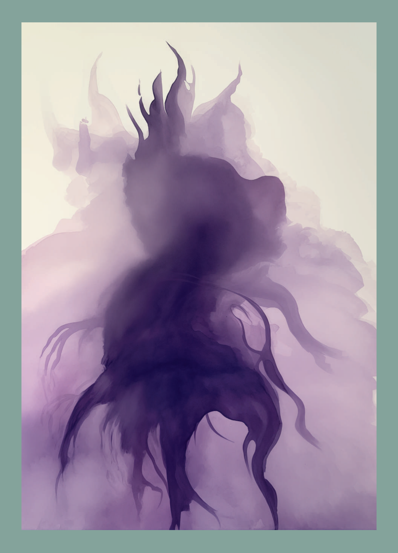
Derivative of "Neutrale Farben"